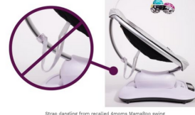
Strap dangling from recalled Anona Mamaloo swing